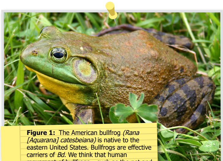
Figure 1: The American bullfrog ( Rana [Aquarana] catesbeiana ) is native to the eastern United States. Bullfrogs are effective carriers of Bd . We think that human movement of bullfrogs – such as the pet and food trade – has contributed to spreading Bd around the world.

How did Bd spread so far and wide? If a pathogen is so deadly that it kills all its hosts, it will soon die off without them. However, each amphibian species responds differently to the infection. Many die quickly, while others carry Bd for